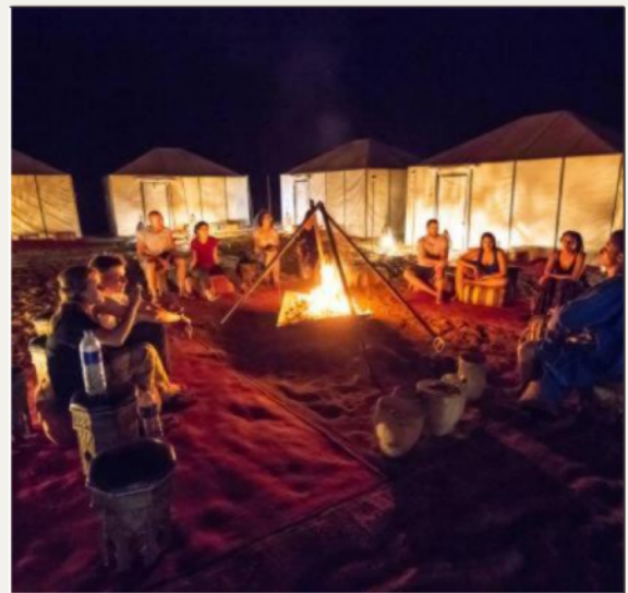
STARGAZING & CAMPFIRE