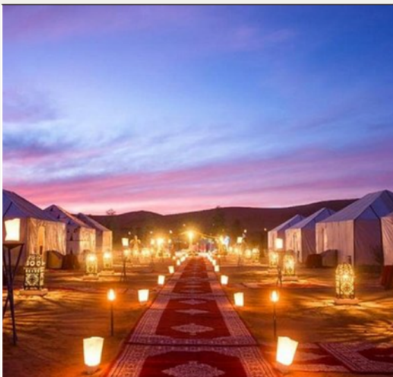
CHECK IN AT LUXURY TENT/ HOTEL