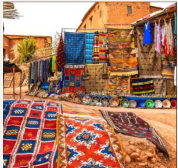
AIT BEN HADDOU