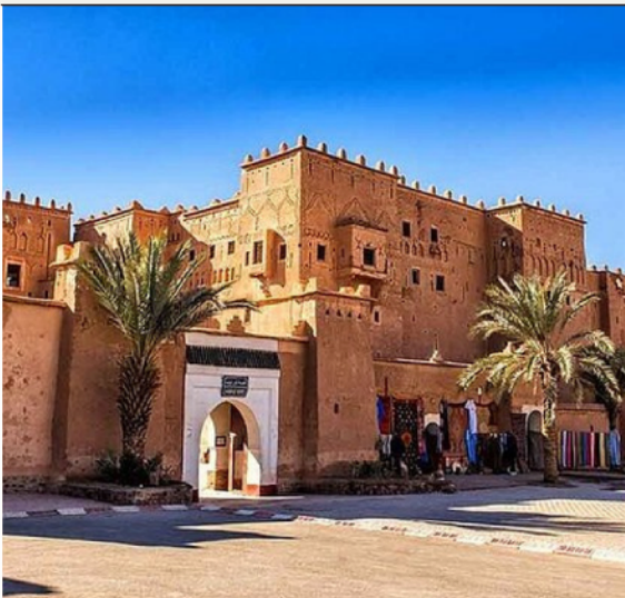
FOSSIL SHOP AT ERFOUD