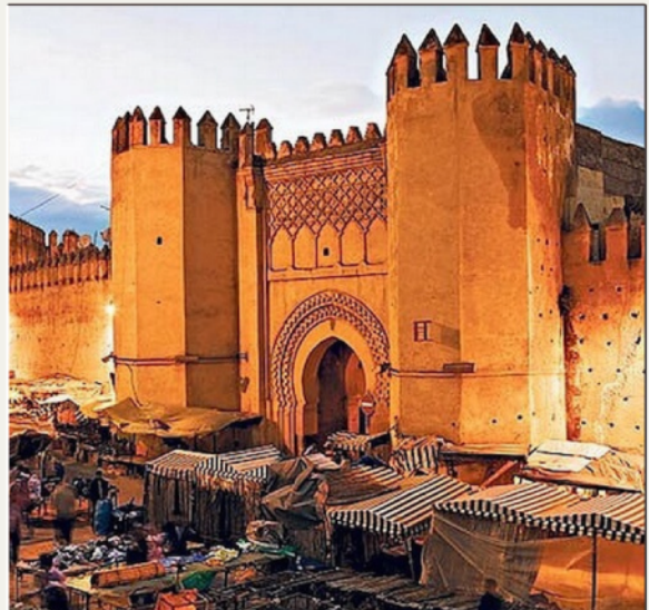
FES OLD CITY