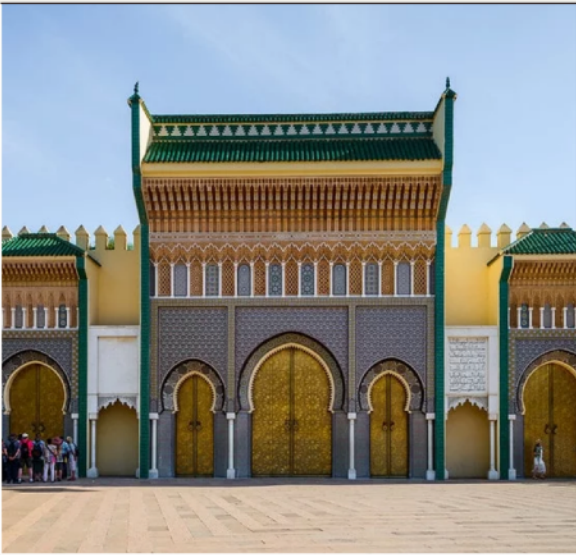
DAR EL MAKHZEN