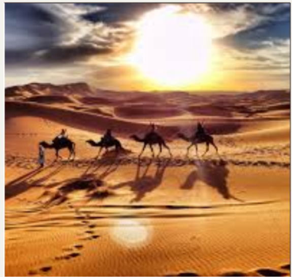
CAMEL RIDE & SUNSET WATCHING