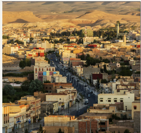
MIDELT (MOROCCO BIGGEST APPLE PRODUCER)