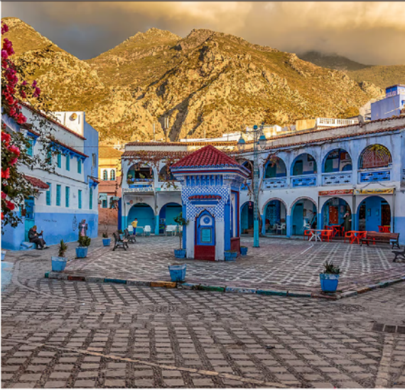
PLACE EL HOUTA