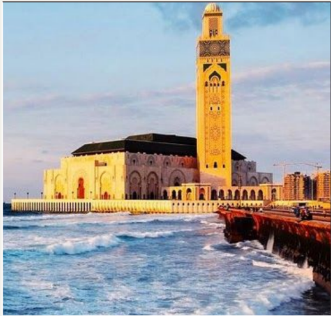
HASSAN SANI MOSQUE