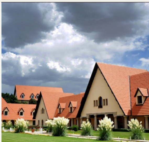
IFRANE (SWISS OF MOROCCO)