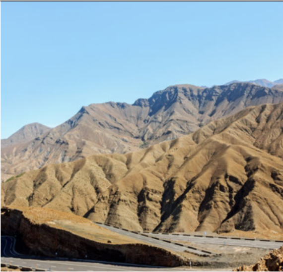
ROADTRIP TO AIT BEN HADDOU VIA TIZI TICHKA