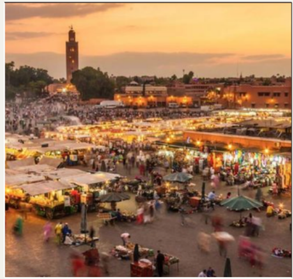
JEMAA EL FNA