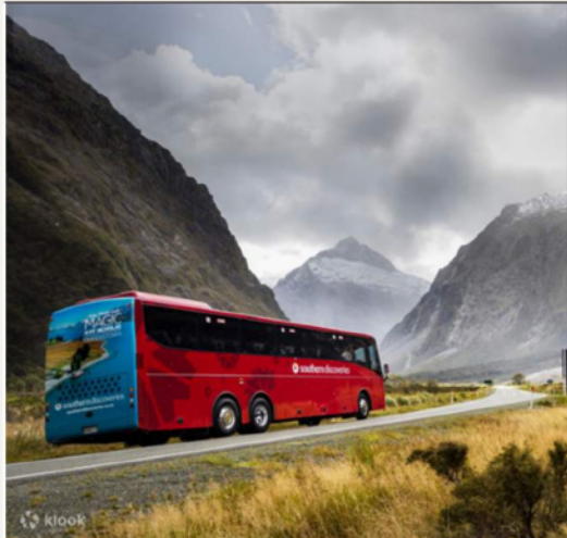
TE ANAU BUS TOUR TO MILFORD SOUND CRUISE