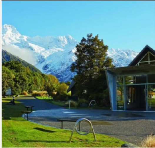
AORAKI MOUNT COOK NATIONAL PARK VISITOR CENTRE