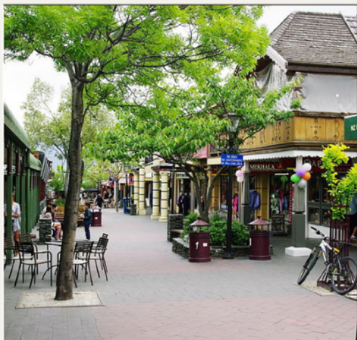
SHOPPING AT QUEENSTOWN