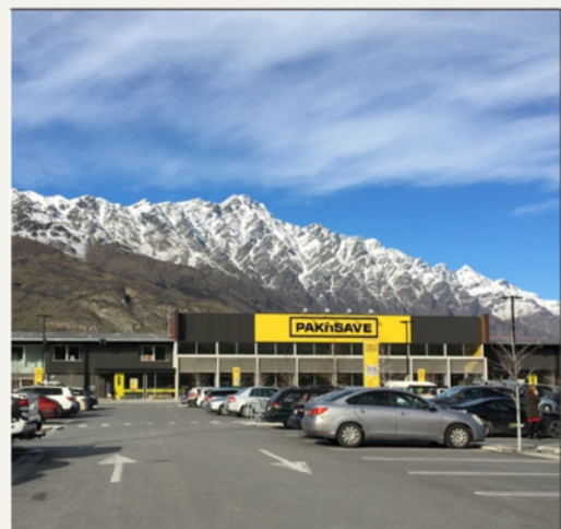
PAK N SAVE QUEENSTOWN