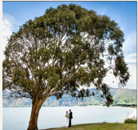
WEDDING TREE HAWEA