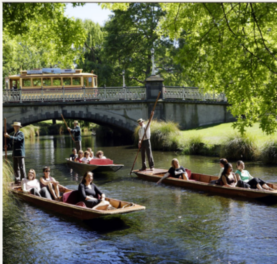
GONDOLA RIDE CHRISTCHURCH