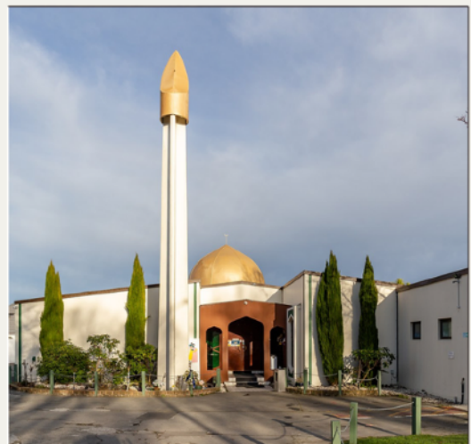
AL NOOR MOSQUE CHRISTCHURCH