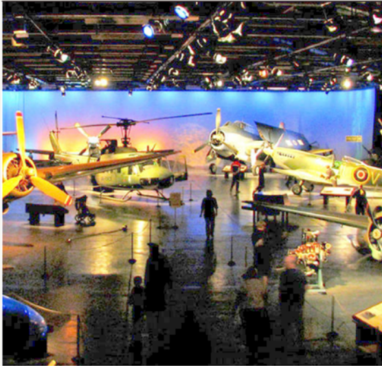
AIR FORCE MUSEUM