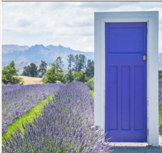
WANAKA LAVENDER FARM