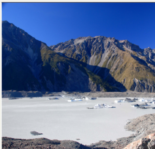
TASMAN GLACIER WALK