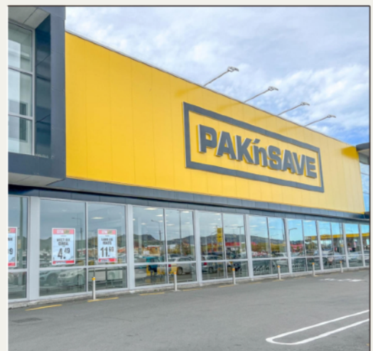
PAK N SAVE CHRISTCHURCH