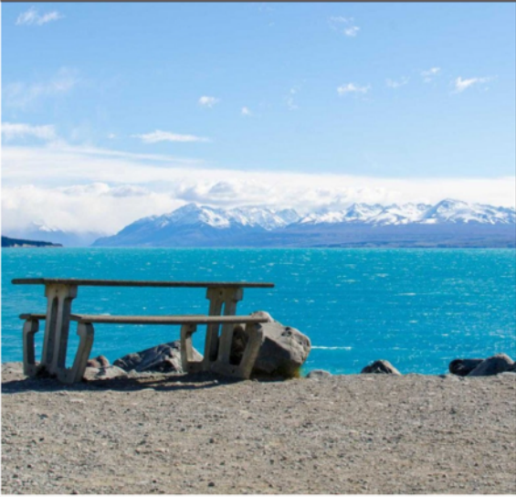
LAKE PUKAKI VIEWPOINT