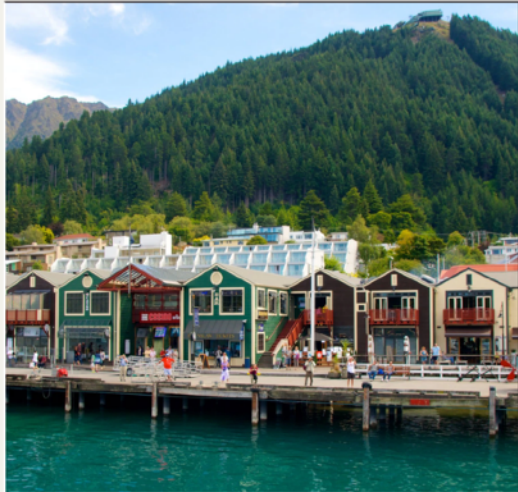
HARBOUR WALK QUEENSTOWN