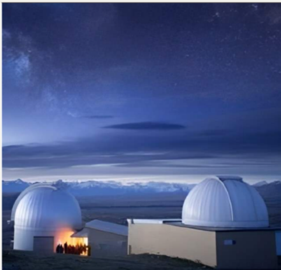
MT JOHN OBSERVATORY