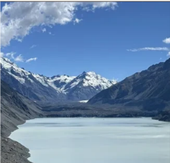
TASMAN RIVER LOOKOUT