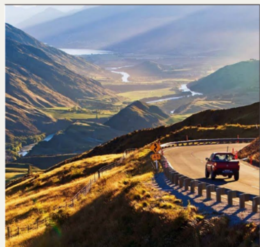
CROWN RANGE ROAD SCENIC LOOKOUT