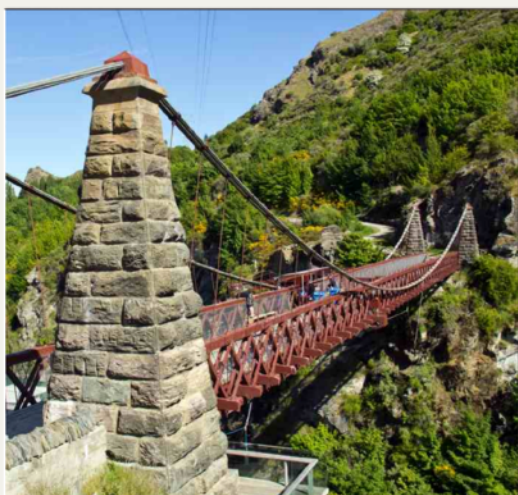
KAWARAU GORGE SUSPENSION BRIDGE