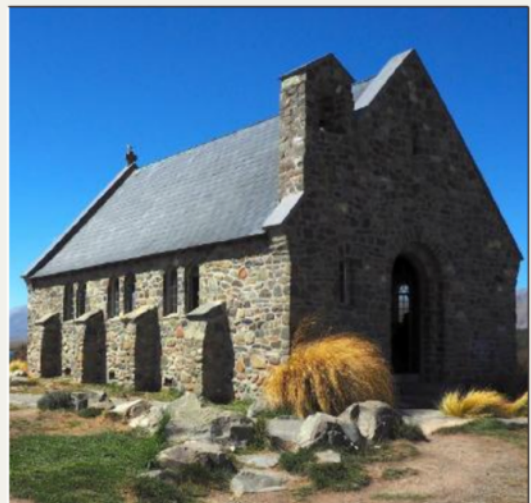
GOOD SHEPERD CHURCH