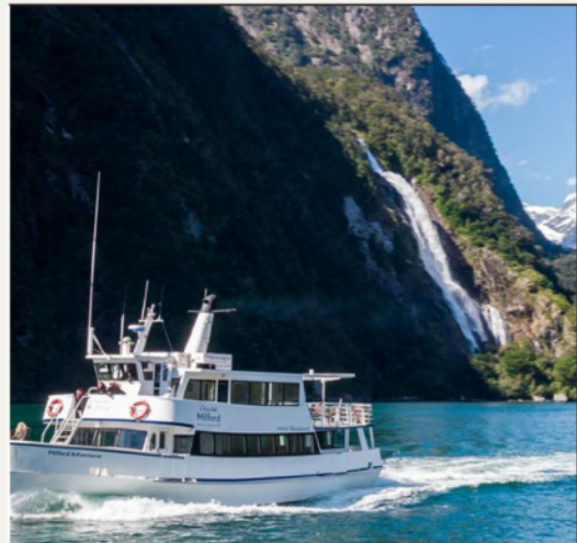
MILFORD SOUND CRUISE