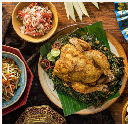
DINNER AYAM BERTUTU