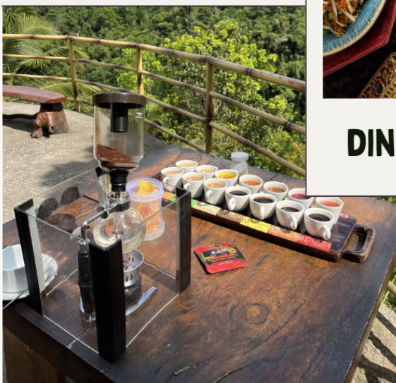
COFFEE PLANTATION LUWAK COFFEE