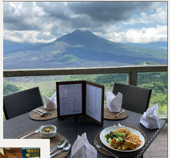
BUFFET LUNCH AT KINTAMANI VOLCANO (MT BATUR VIEW)