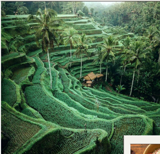
TEGALALANG RICE TERRACE