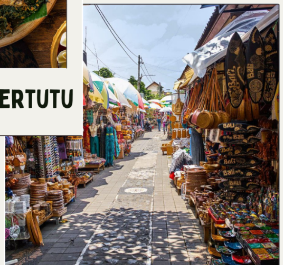
UBUD SUKAWATI MARKET