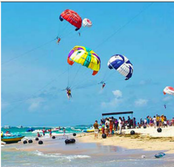
WISATA BAHARI TANJUNG BENOA ( WATERSPORT, DIVING, SNORKLING, PARASAILING)