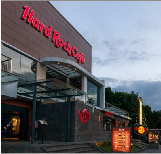
HARD ROCK CAFE