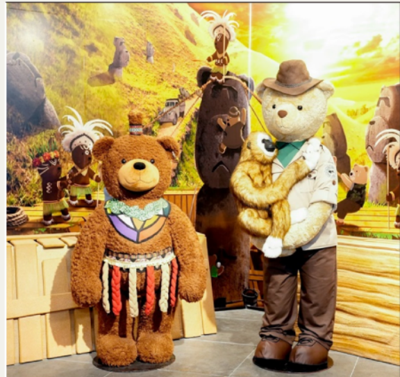
TEDDY BEAR MUSEUM