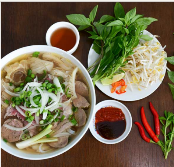
DINNER AT SRI MUTIARA RESTAURANT