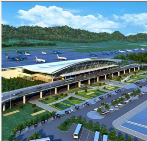
PHU QUOC INTERNATIONAL AIRPORT