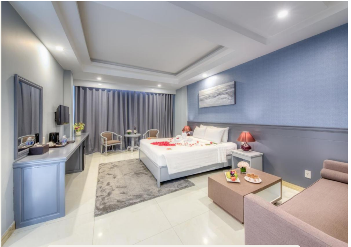
OCEAN PEARL HOTEL, PHU QUOC | www.bossbabetravel.my