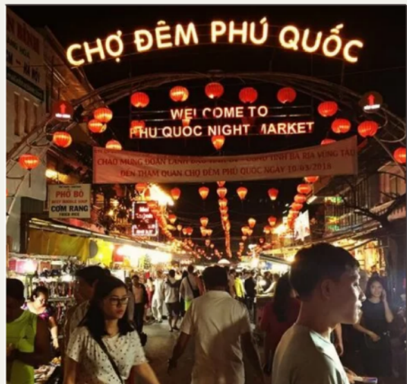
PHU QUOC NIGHT MARKET