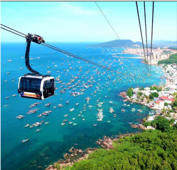
SUN WORLD THOM CABLE CAR