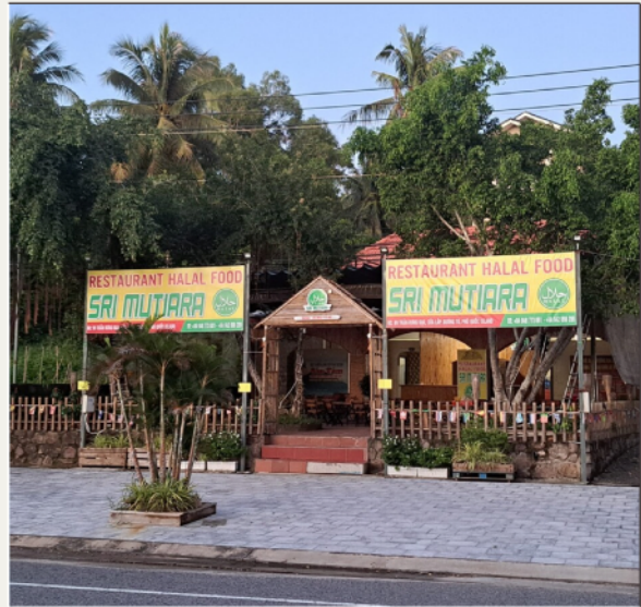
LUNCH AT SRI MUTIARA RESTAURANT