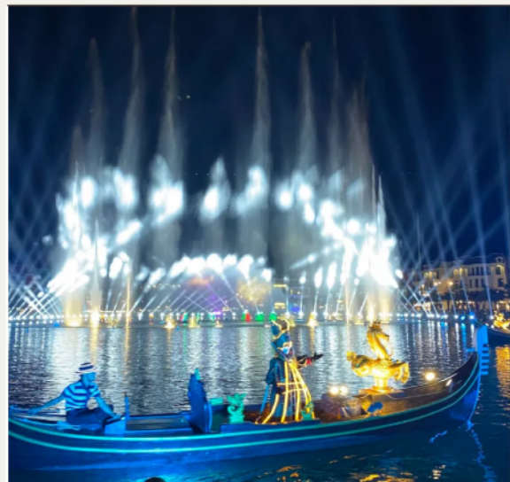
GRAND WORLD (DAY & NIGHT VIEW)