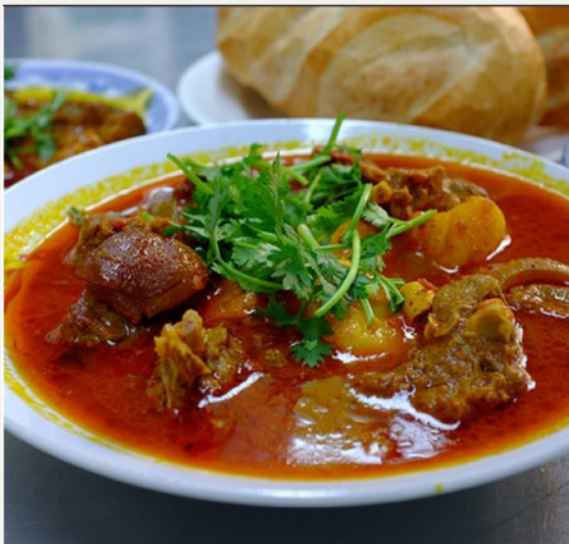
DINNER AT SRI MUTIARA RESTAURANT