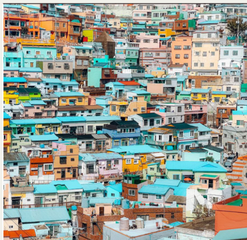
SEONGEUP FOLK VILLAGE