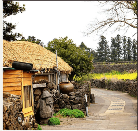
SEONGEUP FOLK VILLAGE