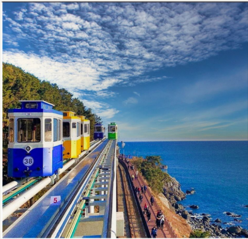
HAEUNDAE BLUELINE PARK