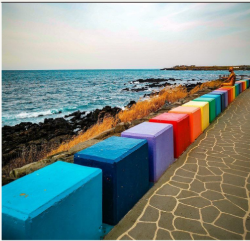
RAINBOW COASTAL ROAD