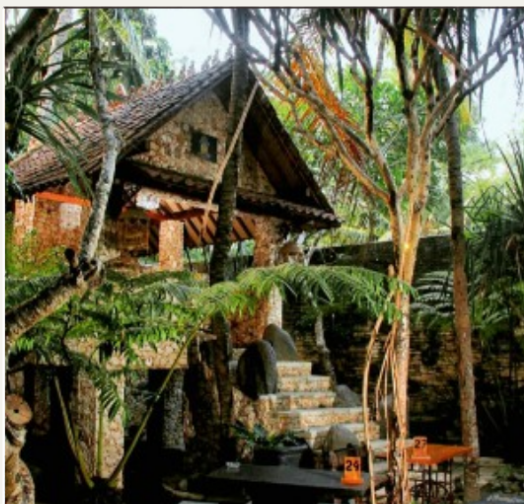
DINNER AT WARUNG POHON OMAH