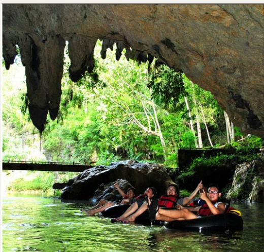
GOA PINDUL CAVE TUBING