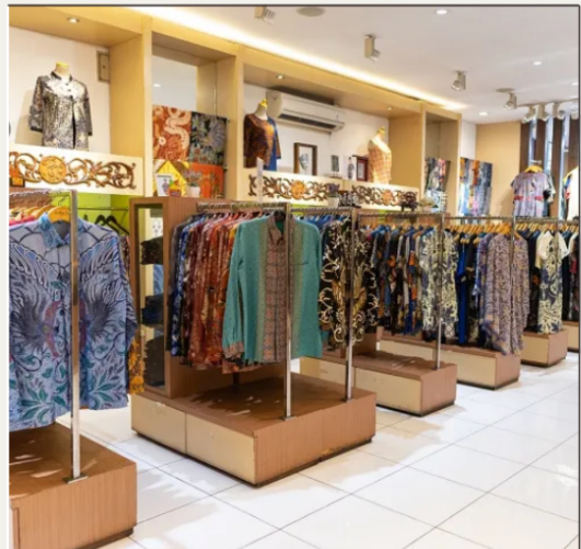
PUSAT BATIK JOGJA