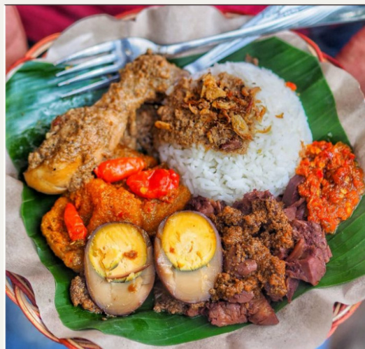
DINNER AT LOCAL RESTO (GUDEG)