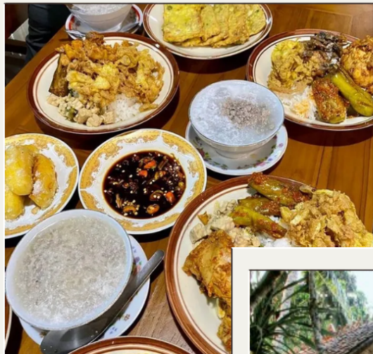
LUNCH AT JULOTUNDA