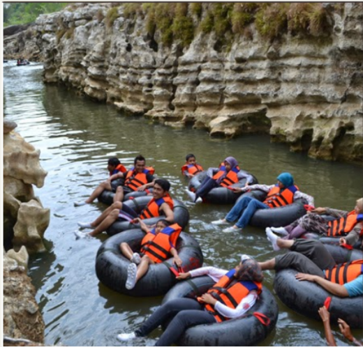
OYO RIVER TUBING