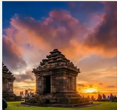
CANDI IJO SUNSET