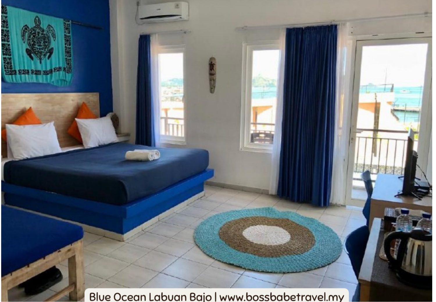
Blue Ocean Labuan Bajo | www.bossbabetravel.my