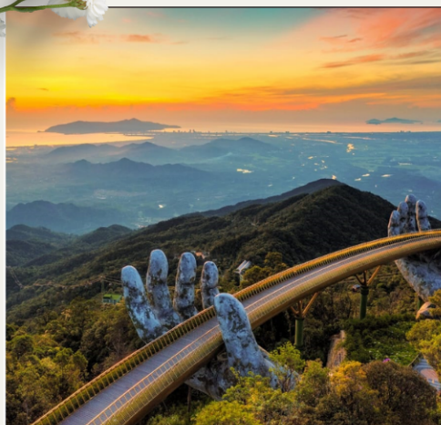
Bars, Wines, Beers GOLDEN BRIDGE