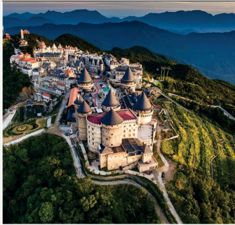
BA NA HILL