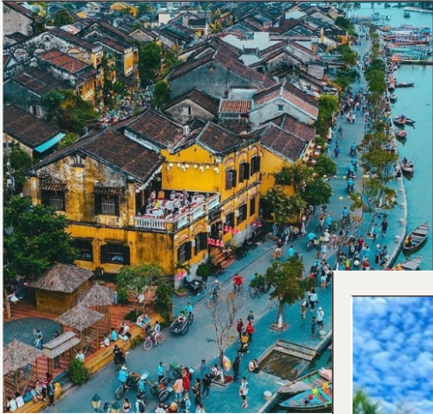
HOI AN CITY