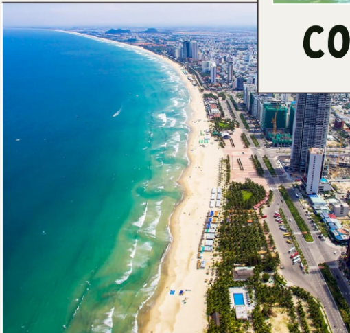
MY KHE BEACH