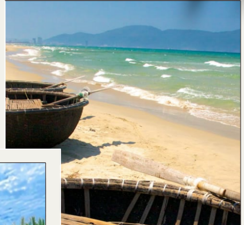
NON NUOC BEACH