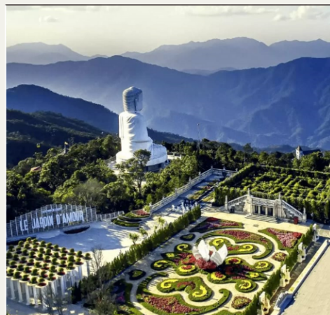
Zoo, Park, Rivers LE JARDIN D' AMOUR