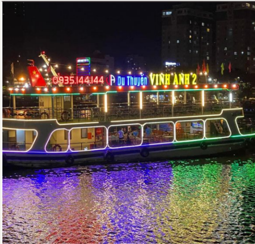
HAN RIVER CRUISE