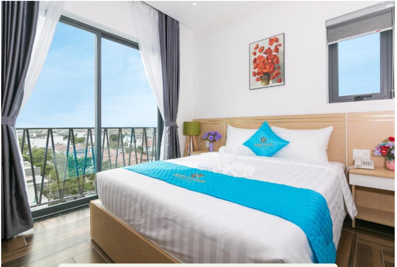
Eurostar Riverside Danang Hotel | www.bossbabetravel.my