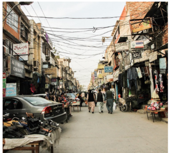
RAWALPINDI SADDAR BAZAAR