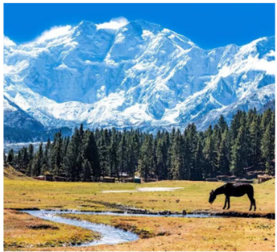
RAKAPOSHI VIEW POINT