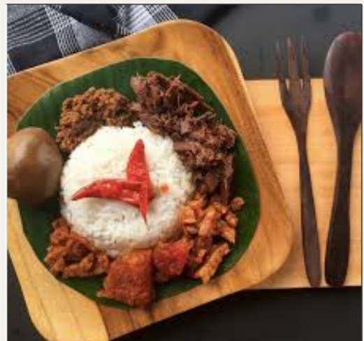
DINNER AT LOCAL RESTAURANT (GUDEG)