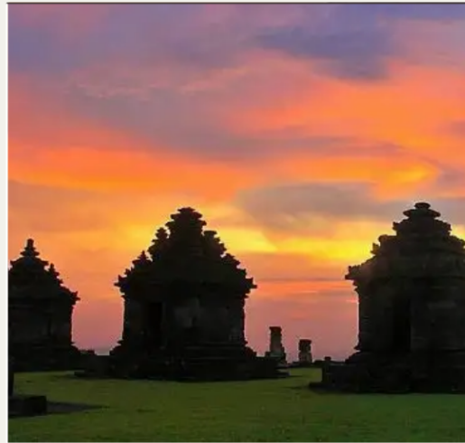
CANDI IJO SUNSET