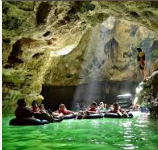
CAVE TUBING GUA PINDUL