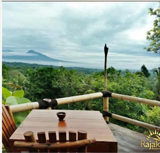
LUNCH AT RAJAKLANA RESTAURANT