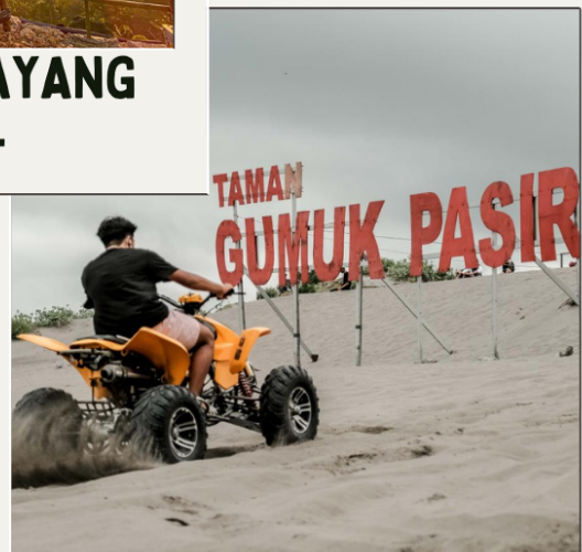
GUMUK PASIR (OPTIONAL)