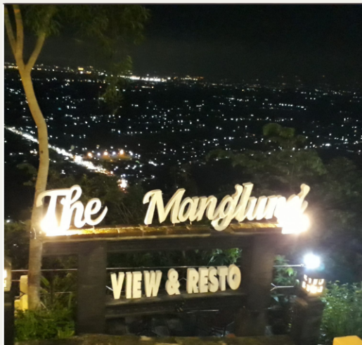
DINNET AT THE MANGLUNG