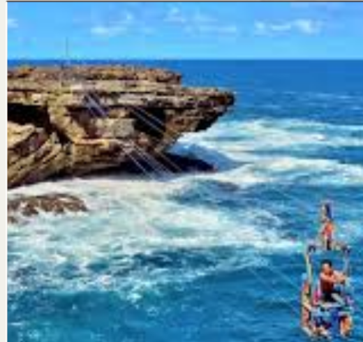
PANTAI TIMANG (GONDOLA)