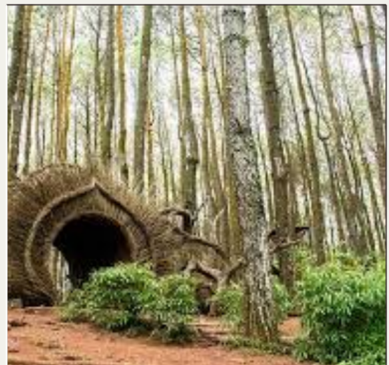
PINUS PENGGER (DEPENDING ON TIME)