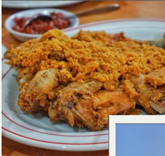
LUNCH AT AYAM GORENG NY SUHARTI